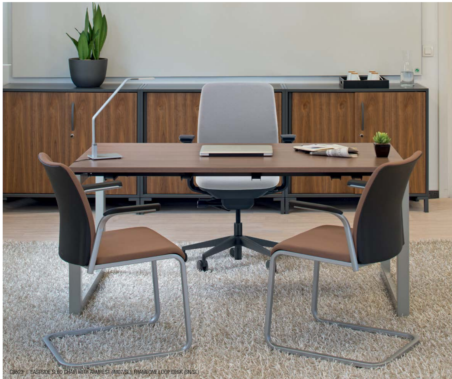
C8523 | EASTSIDE SLED CHAIR WITH ARMREST (M07/SL), FRAMEONE LOOP DESK (SN/SL)

The Eastside chair is designed to provide comfort in various work areas. It offers high performance versatility with good looks. Eastside is a highly flexible solution that feels at home in any space.