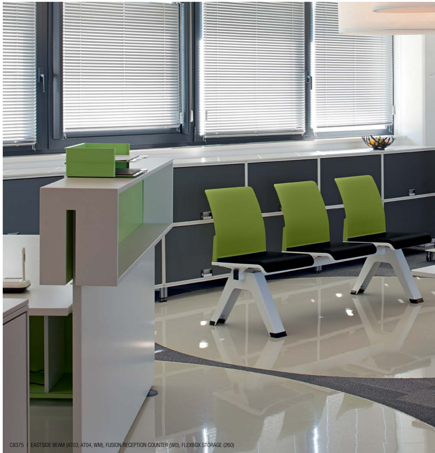
C8375 | EASTSIDE BEAM (AT03, AT04, WM), FUSION RECEPTION COUNTER (W0), FLEXBOX STORAGE (260)