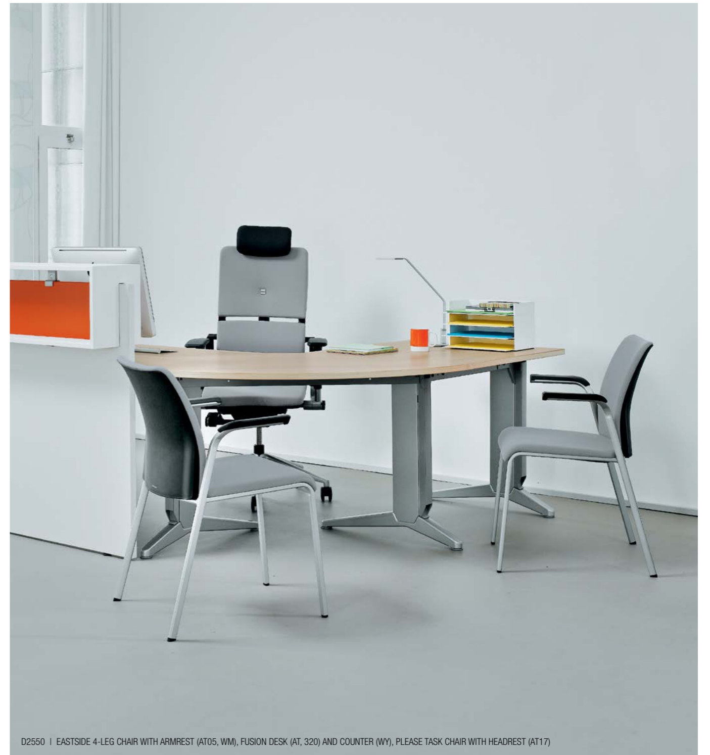
D2550 | EASTSIDE 4-LEG CHAIR WITH ARMREST (AT05, WM), FUSION DESK (AT, 320) AND COUNTER (WY), PLEASE TASK CHAIR WITH HEADREST (AT17)